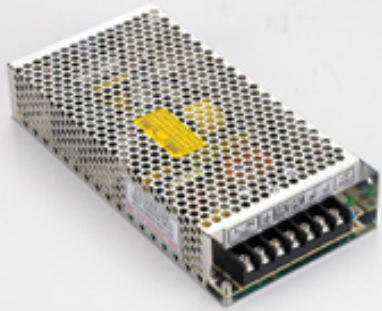
CASE: P15-5 199×98×38mm