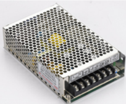
CASE: P15-4 159×98×38mm