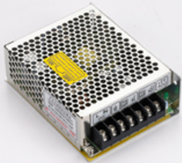
CASE: P15-3 129×98×38mm